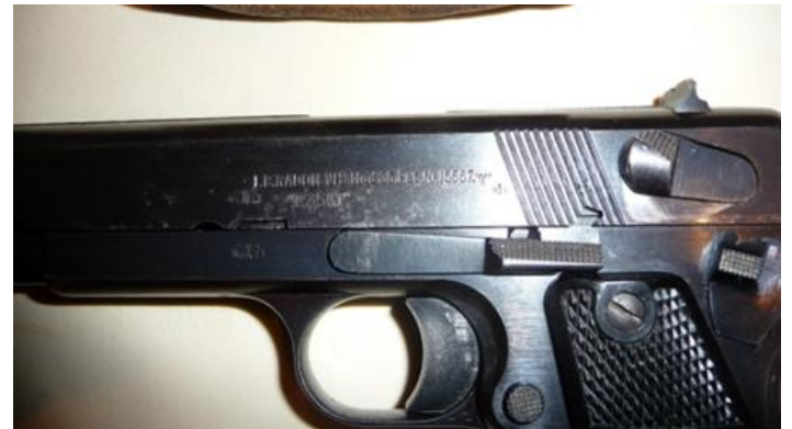
German manufacturing and acceptance stamps shown - Photo – Roy Boehli