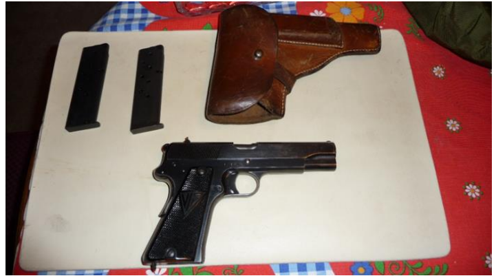
Polish RADOM P-35 9mm Automatic Pistol and EIS recently gifted to the Museum.